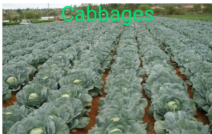
The above images are the products of rural economics in progress for revamping our economy.